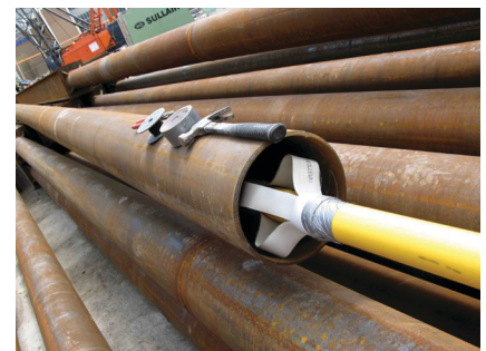
Figure 2. Centralizers in pipe pile section.

In this brief case history, the installation of the inclinometer casing was atypical and the execution was a challenge. There was also unforeseen damage to one of the inclinometer cas-