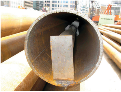
Figure 3. Custom welded inclinometer base.

ings in the midst of construction and the monitoring program.