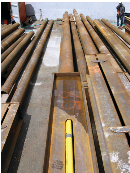
Figure 1. Lower section of pile with inclinometer casing transition to pipe pile.

At a high-rise condominium project in downtown Toronto, the monitoring plan included inclinometer casings attached to piles, and targets on the piles for monitoring movement of the shoring wall. These reflective targets are typically placed at the top of each pile for monitoring of horizontal and vertical movement of the shoring and are surveyed with an accuracy of \pm 2 mm. A typical site can have 100 to 300 piles. While there is expected